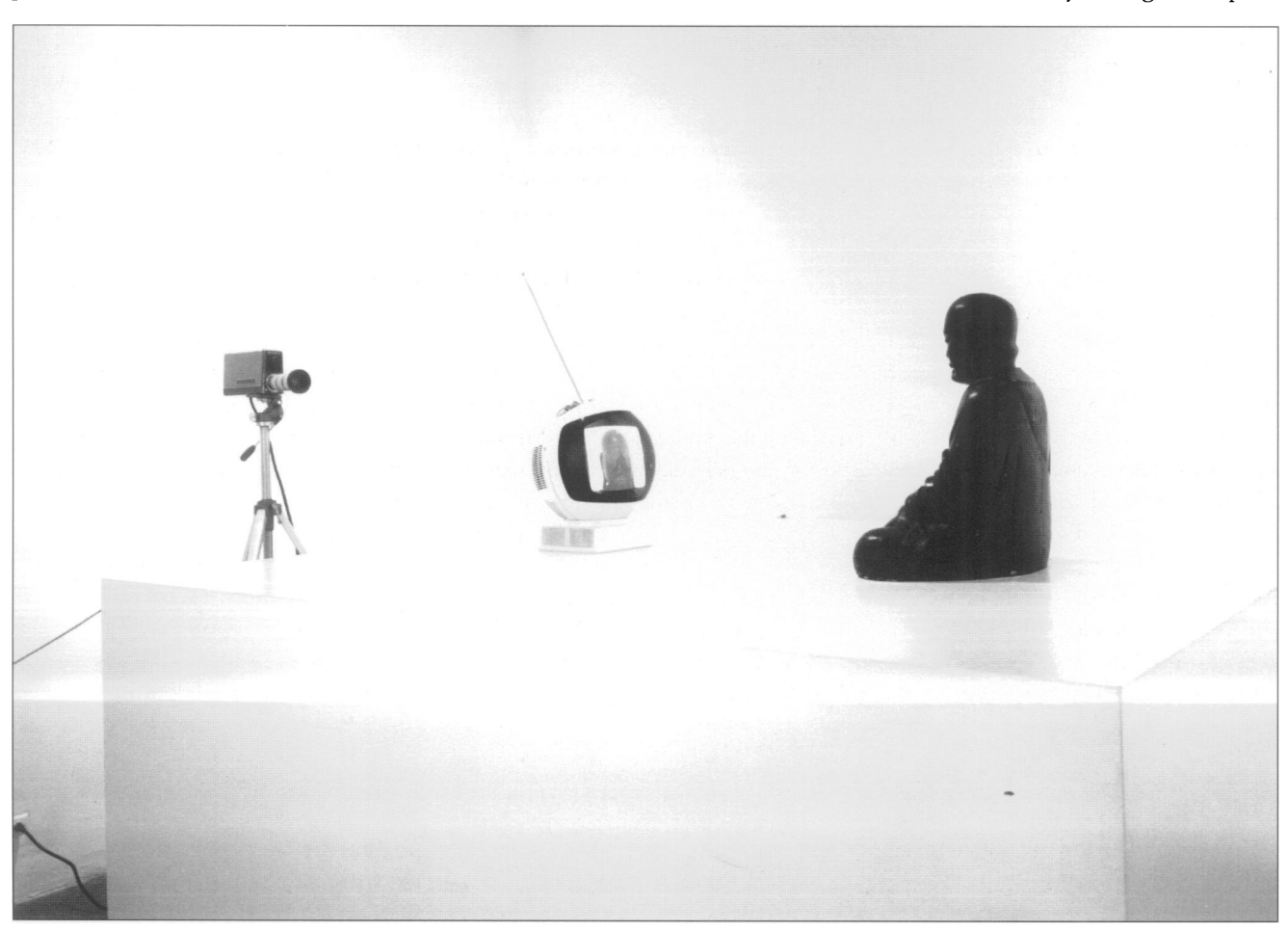
Fig.1. Nam June Paik, TV Buddha (1974). Installation with closed-circuit video camera, monitor, and sculpture.

Monet's famous paintings of water lilies put multiple spaces in the same place. At least three distinct spaces can be discerned: the surface of the water on which the lily pads float, the shallow space below the surface of the water where the stems of the water lilies are visible, and the sky of clouds reflected from the pond's surface. Monet intends that the three milieus be seen concurrently. Though this spatial