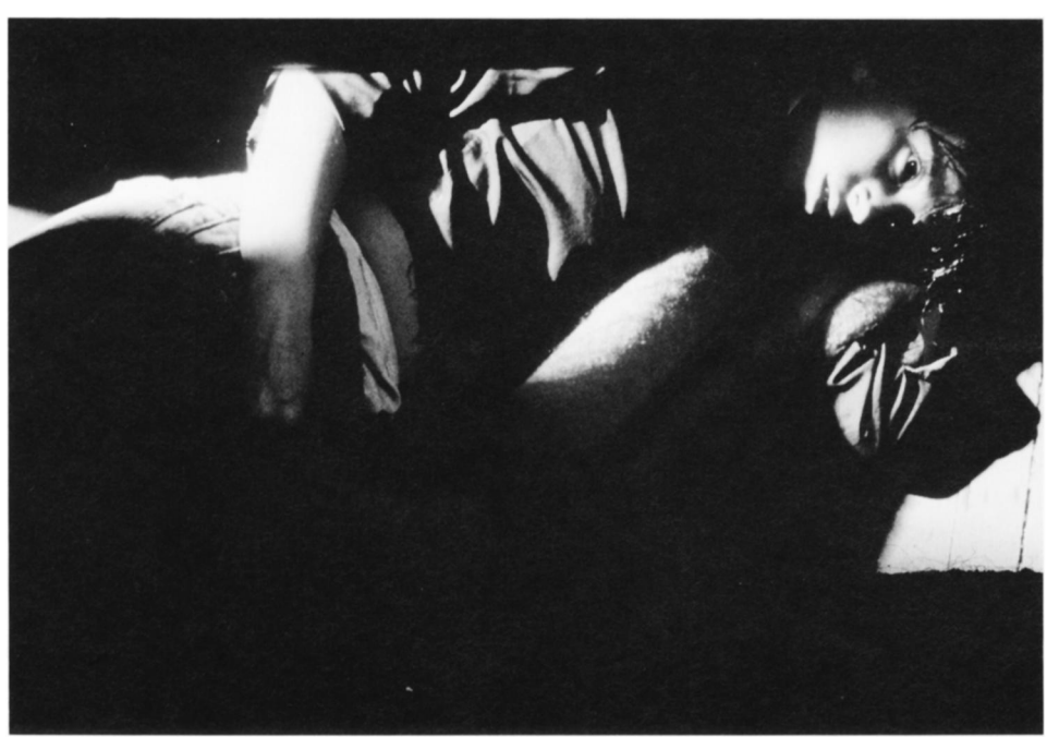
Cindy Sherman. Untitled #87. 1981.