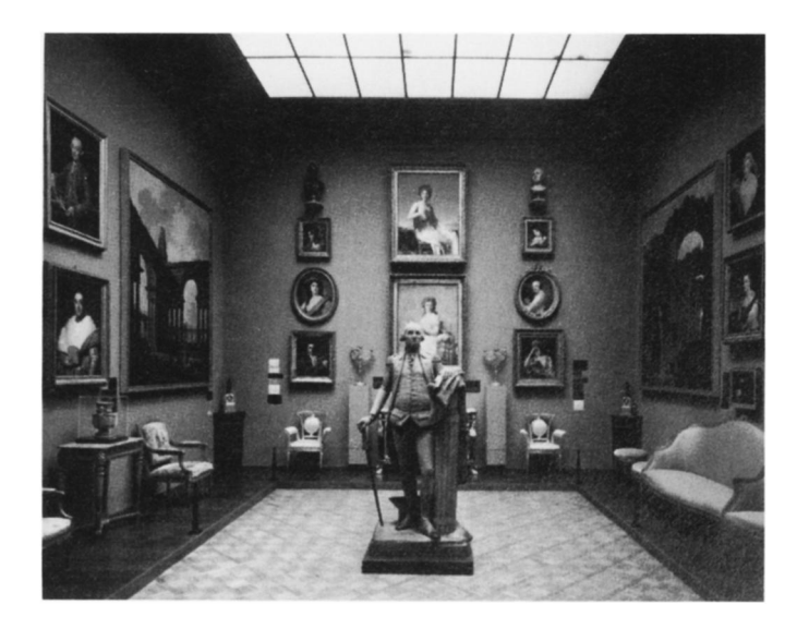
Michael Asher. Installation at the Art Institute of Chicago. 1979.