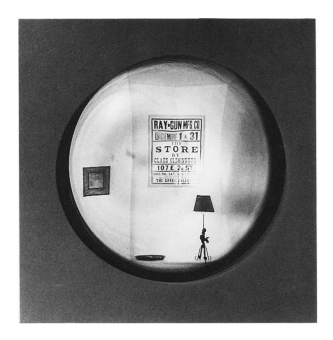
Louise Lawler. Untitled (Rooster). 1993.