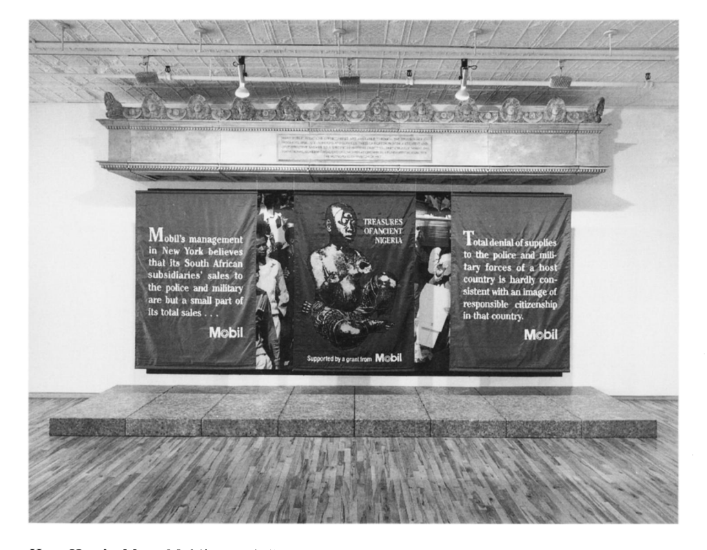
Hans Haacke. MetroMobiltan. 1985.